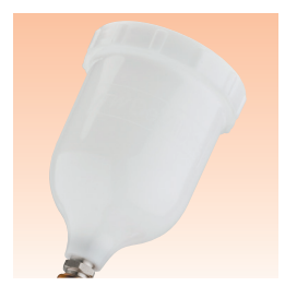
Gravity cup pt. no. GFC-501